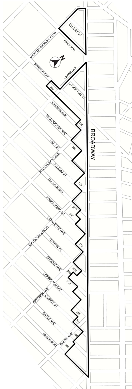
Portion of Community District 3, Brooklyn