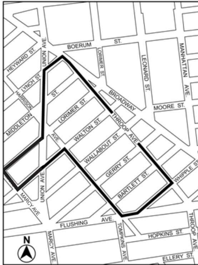
Portion of Community District 1, Brooklyn