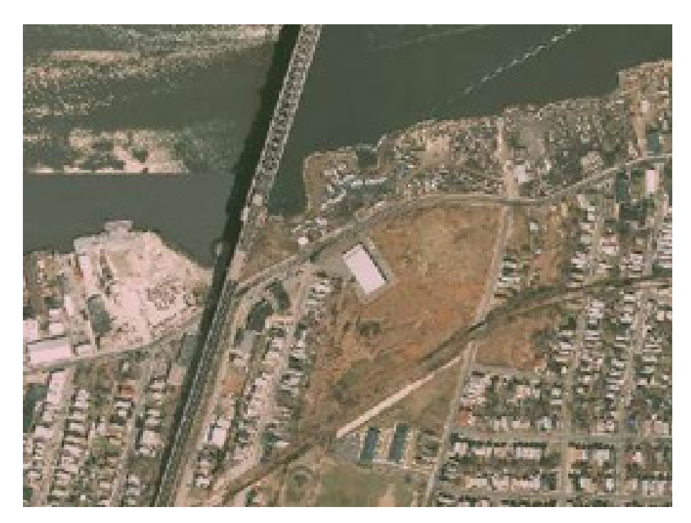
Aerial Photo of the Bayonne Bridge Port Authority Property 2007