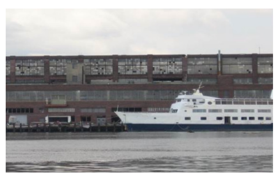
Mariners Harbor, Bulkhead and Piers of Old Bethlehem Steel Shipbuilding Company

Inundated during Hurricane Sandy: Richmond Terrace after Van Pelt to South Avenue, lower De Hart Avenue, lower Union Avenue, lower Coonley Court,