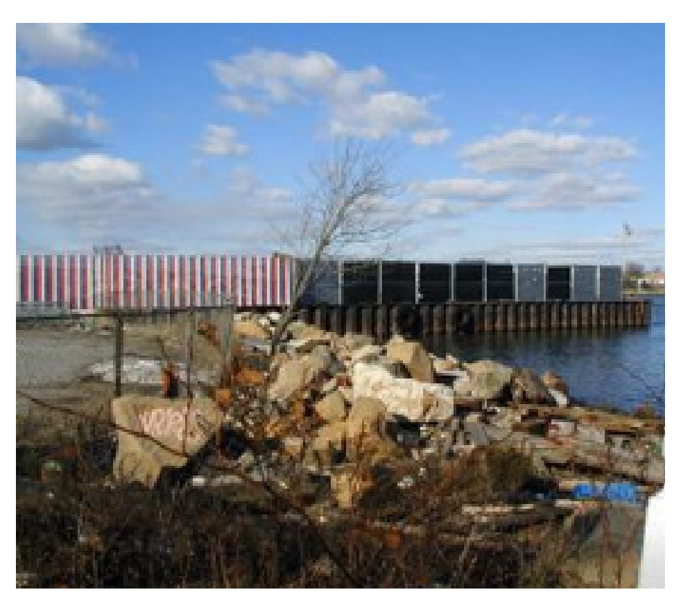
Flag Container Company, NSWC Archival Photo 2008

left over from its ferry use days. Ferry Service ended service in the early 1960s.