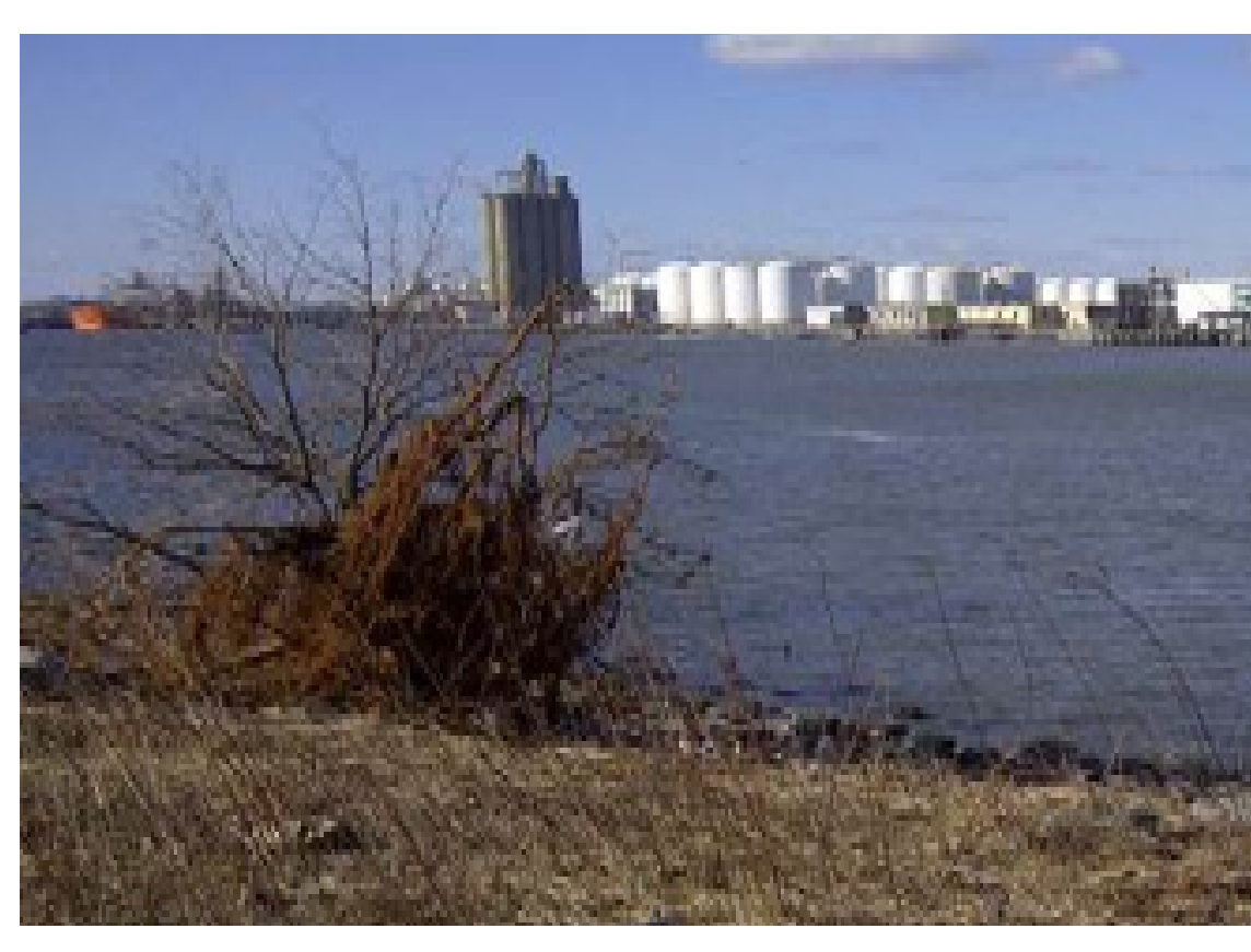
St. George's Waterfront at Bank Street across from Bayonne, New Jersey's Industrial waterfront

In looking at the eroded shoreline from the land, we began to wonder what the North that, when driving along Shore waterfront looked like from the water. More specifically, we began to wonder what kind of protections that we, as a waterfront community, have from environmental hazards that could easily be combined with man-made conditions that can become dangerous or hazardous.