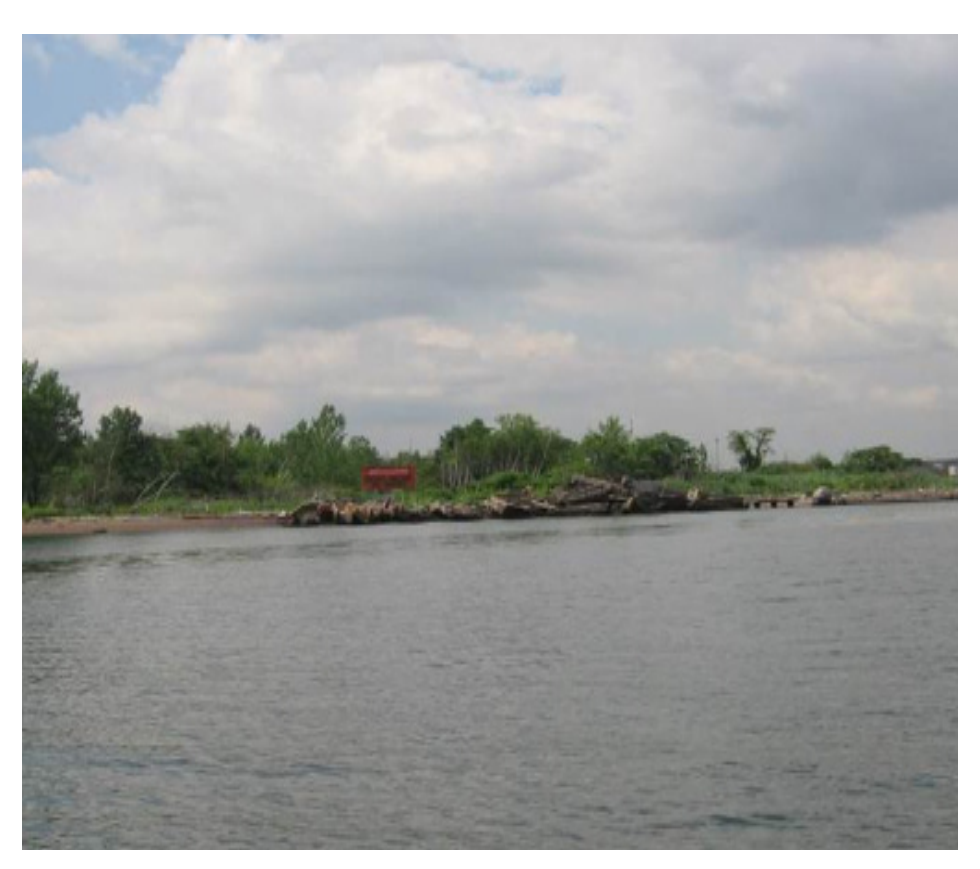
Arlington Marsh 80 Acres Tidal Wetlands and Cove A Natural Resiliency Buffer

Making the bend to Arlington Marsh, this stretch of Arlington Marsh has a sand beach that is often times covered with debris and garbage that has floated on it. The tidal wetlands and cove of Arlington Marsh and the freshwater wetlands of Mariners Marsh acted as natural buffers and sponges when Hurricane Sandy's storm surge hit the island. The residents living near these wetlands were protected from the storm surge and flooding.