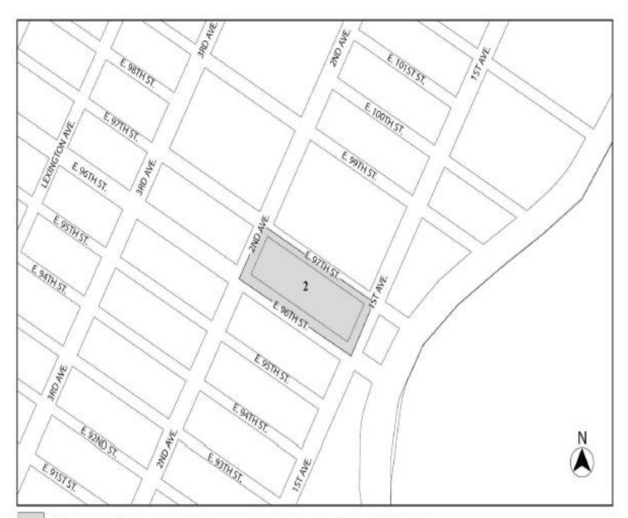
Mandatory Inclusionary Housing Program Area See Section 23-154(d)(3) Area 2 - [date of adoption] MIH Program Option 1