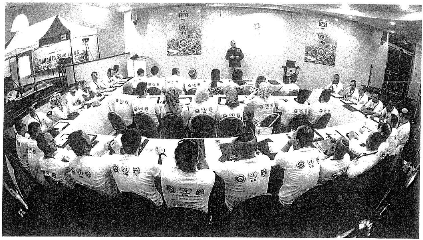
'AKA's joint disaster preparedness training with the GLSHD.

Israel's first-responders form kaleidoscope of cultures | ISRAEL21c