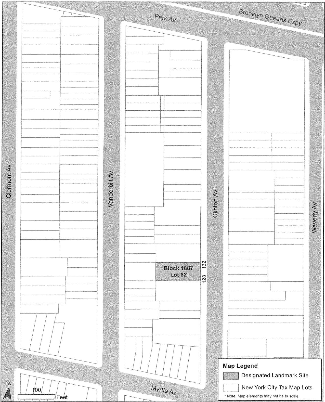
HENRY AND SUSAN McDONALD HOUSE (LP-2543), 128 Clinton Avenue (aka 128-132 Clinton Avenue & 128 Rear Clinton Avenue) Landmark Site: Borough of Brooklyn, Tax Map Block 1887, Lot 82

Public Hearing: June 2, 2015 Designated: June 16, 2015