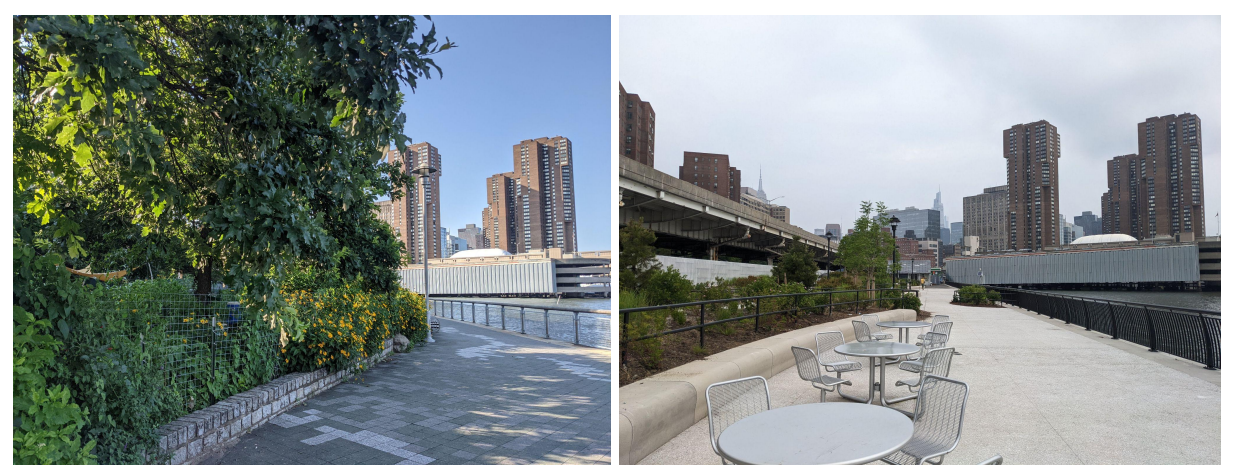
Before and After the ESCR: Stuy Cove Park 1.0 and 2.0

I am also a Trees NY Citizen Pruner and pay close attention to the extreme conditions our poor street trees endure. In fact, the mature lindens outside of my home were battered this winter by a scaffolding installation and may never recover. Our street trees provide so much for us urbanites in exchange for so very little. They clean our air, absorb our stormwater, shade our homes, provide habitat, and buffer noise, all in exchange for maybe 36 square feet of compacted dirt on a gritty city street. If New York is to be a leader in sustainable solutions to climate change it is time for us to acknowledge the role these gentle giants play in building a healthy and resilient city by funding the study, stewardship and long term care of our arboreal neighbors. Much as we saw last week with the passage of the Zero Waste Act, the time is now for NYC to implement an Urban Forest Master Plan and to integrate our city trees and urban tree canopy into our long term sustainability planning.