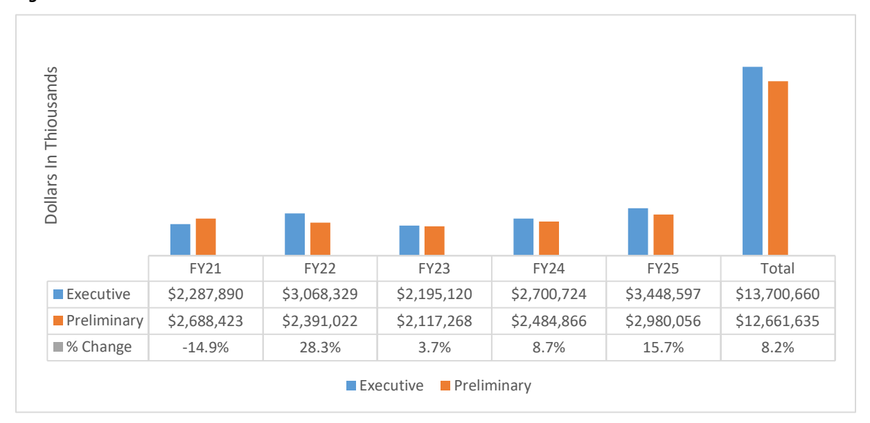
Figure 2: DEP's Commitment Plan

DEP's Executive Capital Commitment Plan includes $13.7 billion in Fiscal 2021-2025, with $2.3 billion in Fiscal 2021. This represents 14.7 percent of the City's total $93 billion Executive Capital Commitment Plan.