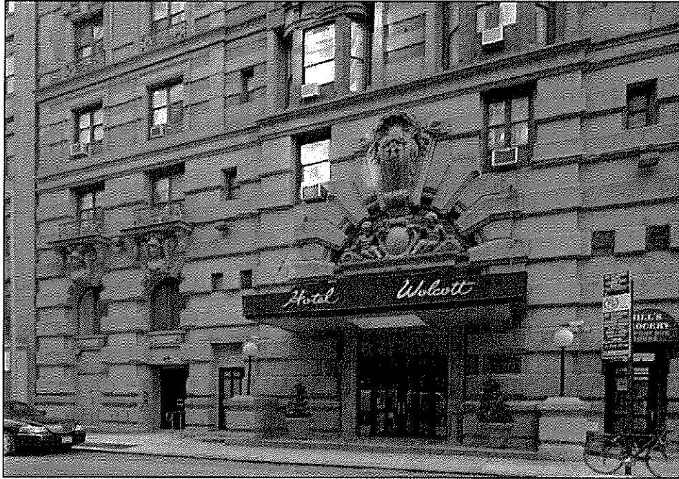
Hotel Wolcott Ground floor and entrance Photos: Christopher D. Brazee, 2011