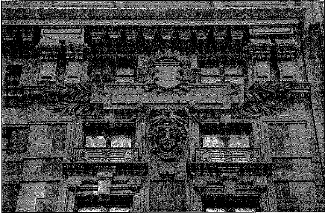
Hotel Wolcott Copper and Terra-Cotta Details