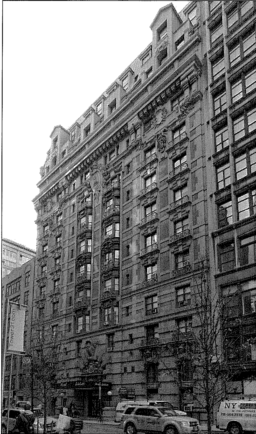
Hotel Wolcott 4 West 31 Street (aka 4-10 West 31 Street) Manhattan Manhattan Tax Map Block 832, Lot 49