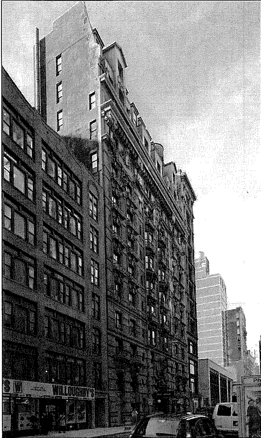
Hotel Wolcott View from East