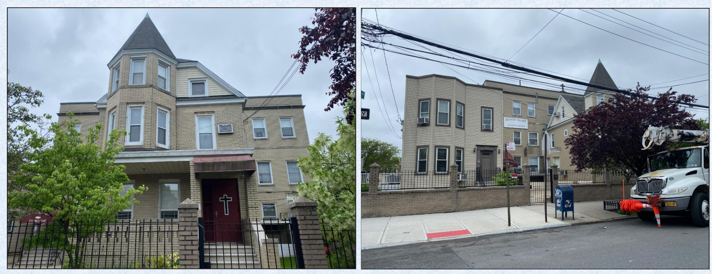
View southwest on Zerega Avenue to the three-story house with a three-story school addition at 1651 Zerega Avenue (p/o Lot 78)