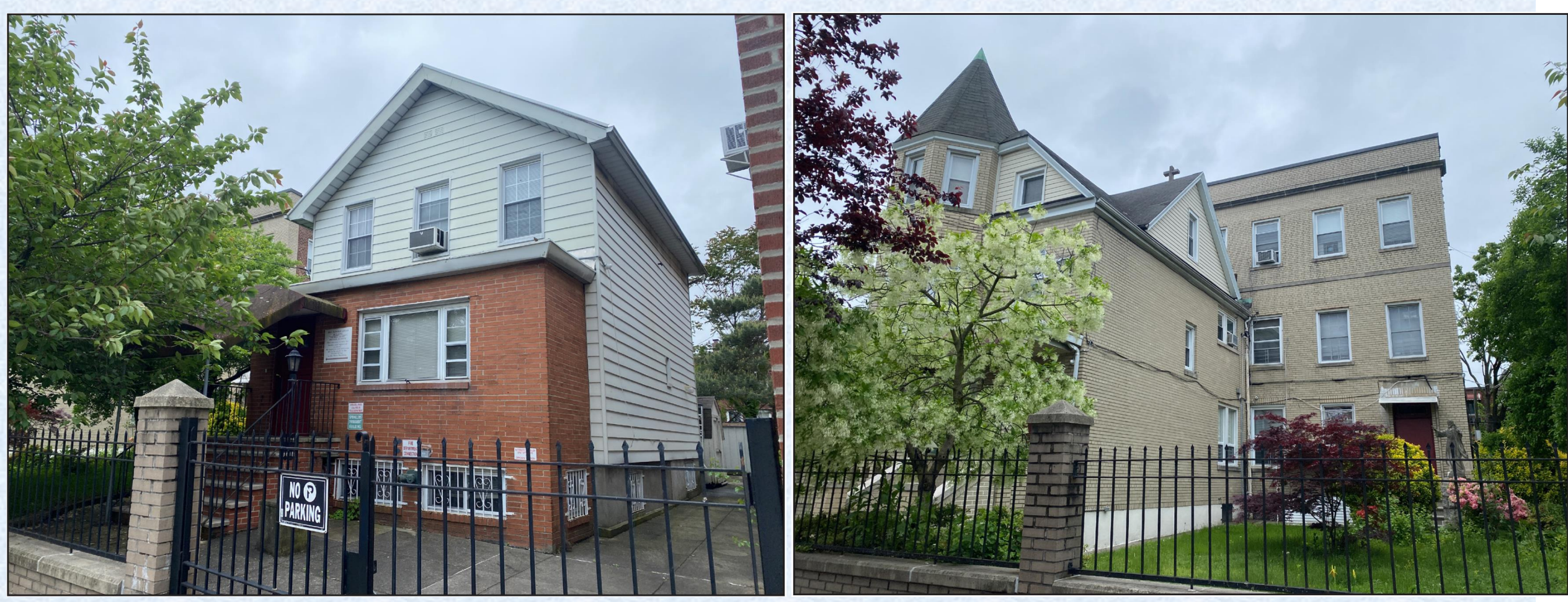
View south on Zerega Avenue to the two-story house at 1659 Zerega Avenue (Lot 75)