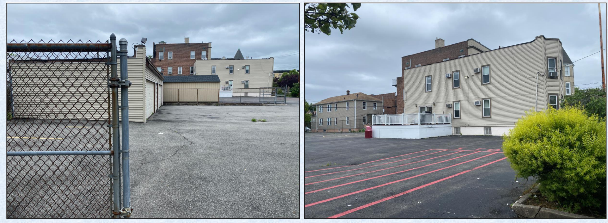
View northwest on St. Raymond Avenue to the one-story garage at 1631 Zerega Avenue (Lot 87)