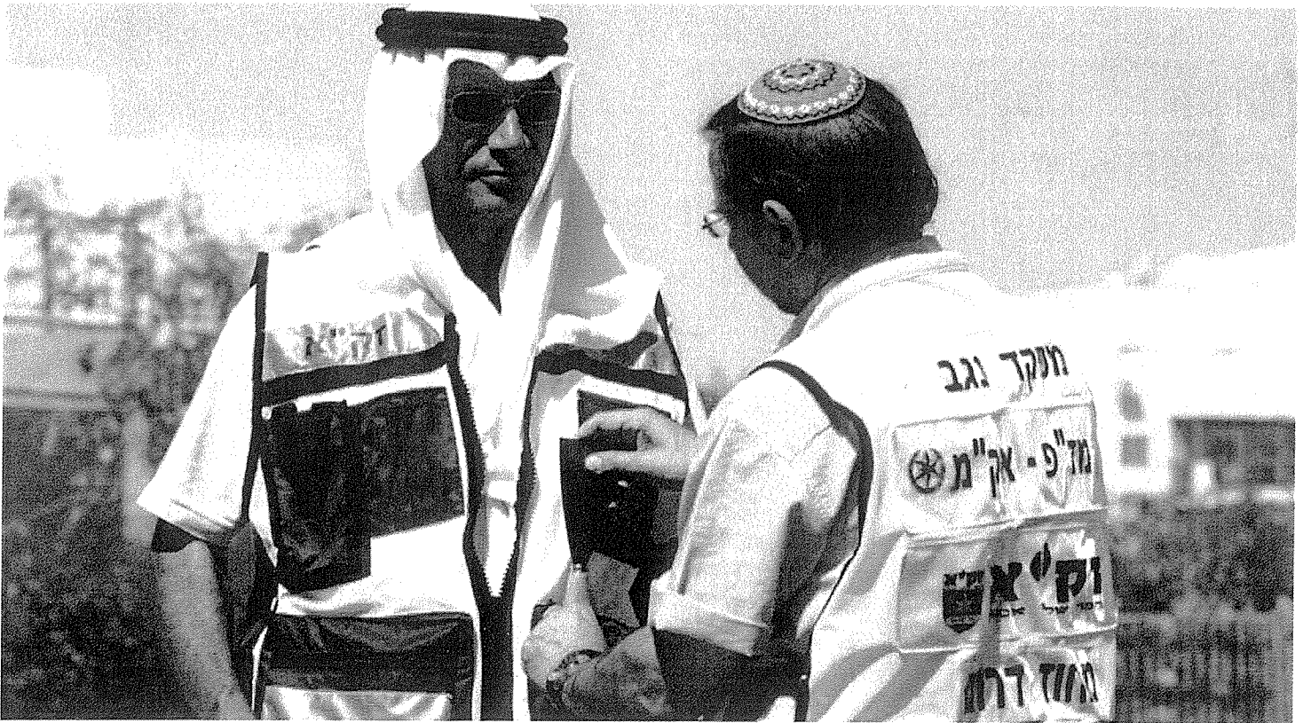
Arab and Jewish ZAKA volunteers in the Negev prepare to rescue victims together.

By Abigail Klein Leichman | SEPTEMBER 1, 2016, 8:30 AM