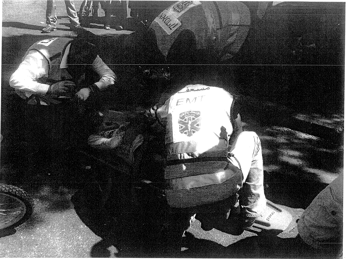
From left, ultra-Orthodox, secular Jewish and Arab volunteers from United Hatzalah working together.