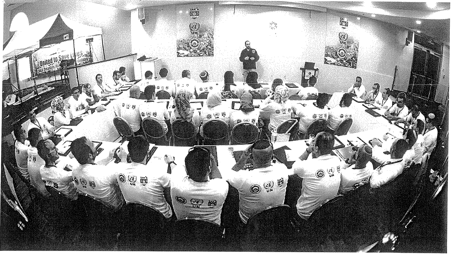
AKA's joint disaster preparedness training with the GLSHD.