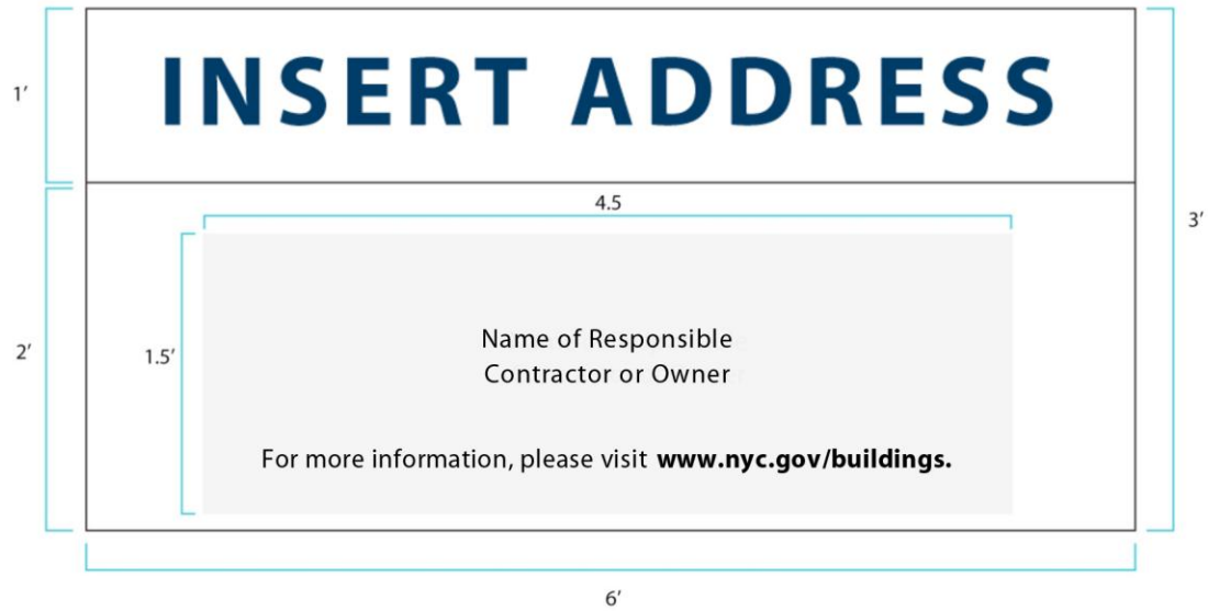
FIGURE 3301.9.2.1(1) SIDEWALK SHED PARAPET PANEL LAYOUT