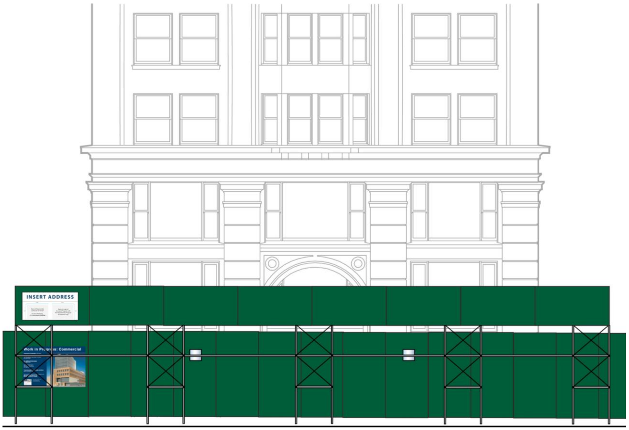
FIGURE 3301.9.2.2 PANEL POSTING ELEVATION DIAGRAM