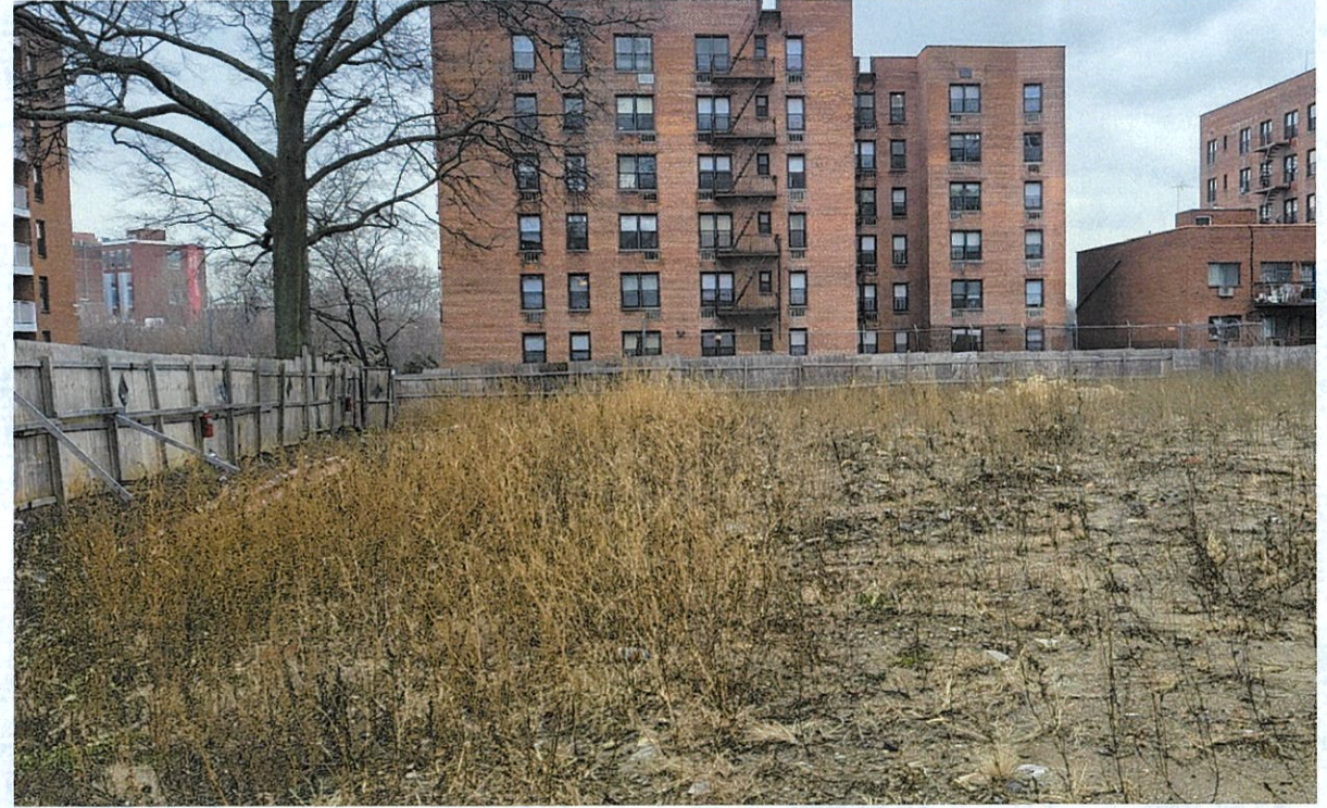
View of the project site facing Southwest