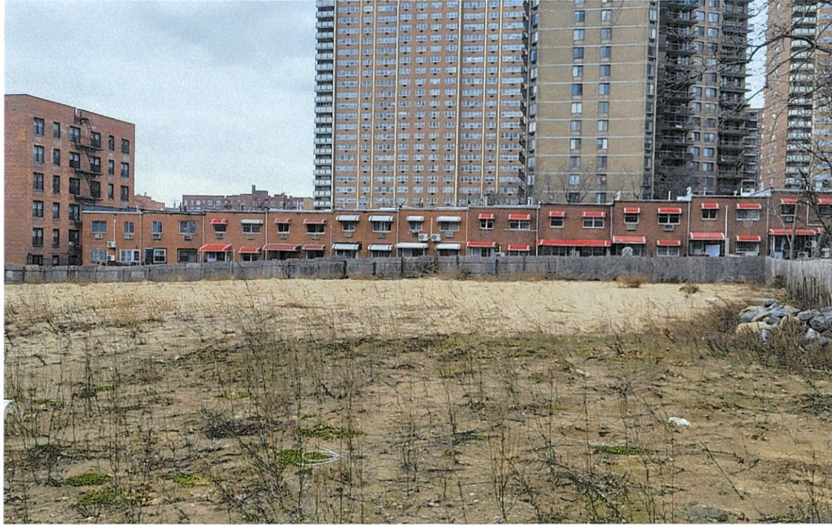
View facing northwest from the southeast along 45th Avenue.