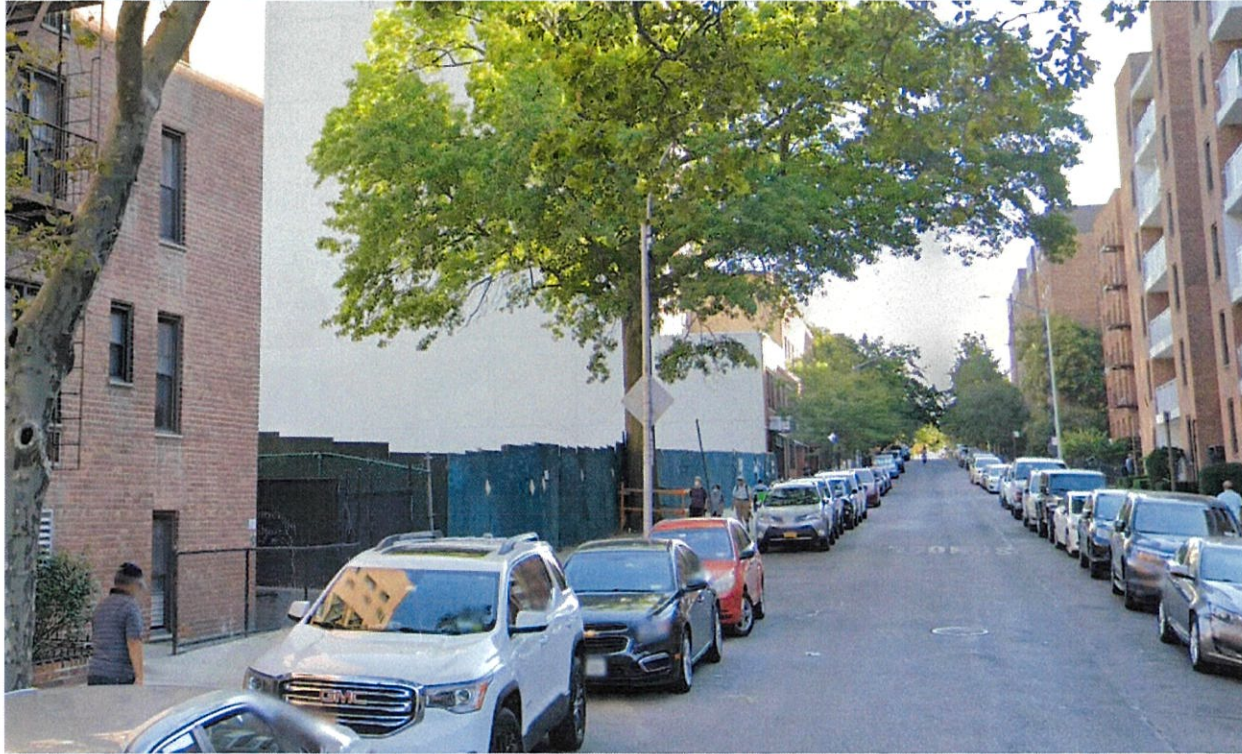
Another view facing East on 45 th Avenue with surrounding apartment buildings.