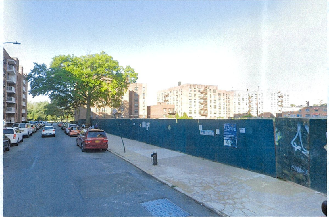
View facing West on 45th Avenue with surrounding apartment buildings.