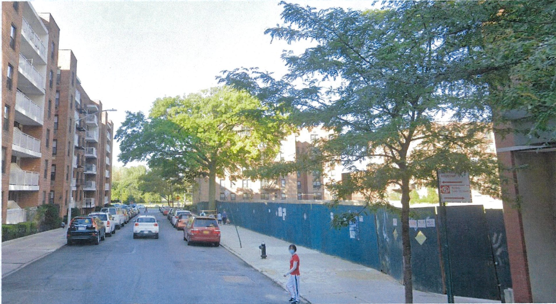
Street view looking West on 45 th Avenue.