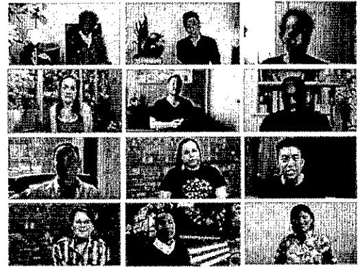
Stills from VideoOut's Digital Library

In 2019, we will launch a significantly upgraded digital platform on VideoOut.org. Working with design agency OrangeYouGlad, VideoOut's new website will enable a user to seamlessly capture and submit their story to the VideoOut Library. While anyone can currently submit their story, the process requires considerable user initiative and technical familiarity; we believe that simplifying the technical process will dramatically increase and diversify story submissions.