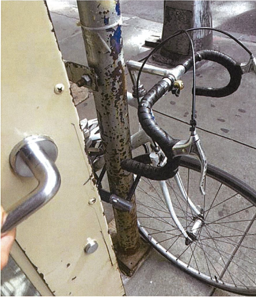
bike locked to 49 Walker scaffolding