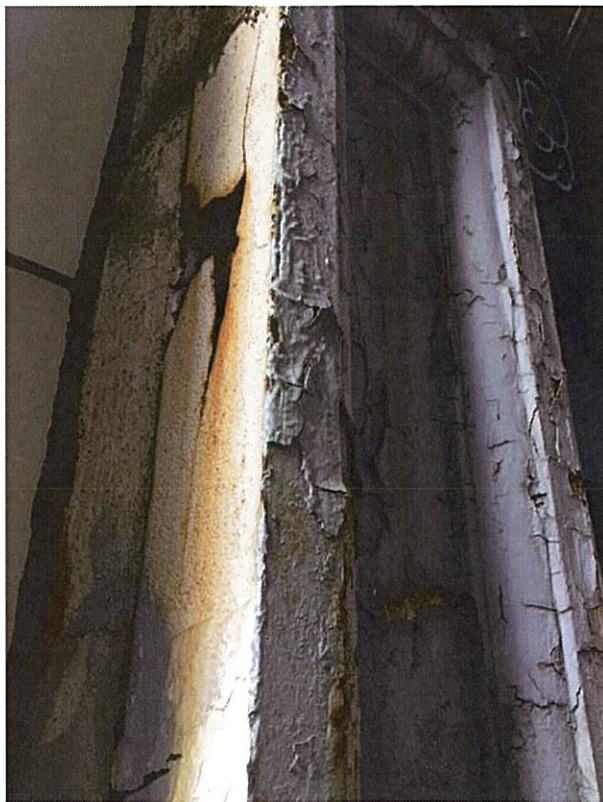
49 Walker facade