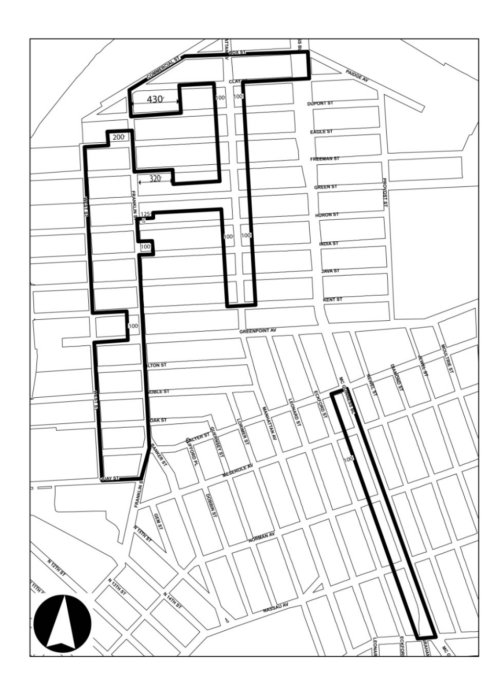
Map 1 Portion of Community District 1, Brooklyn