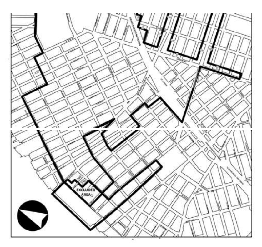
Portion of Community District 1, Brooklyn