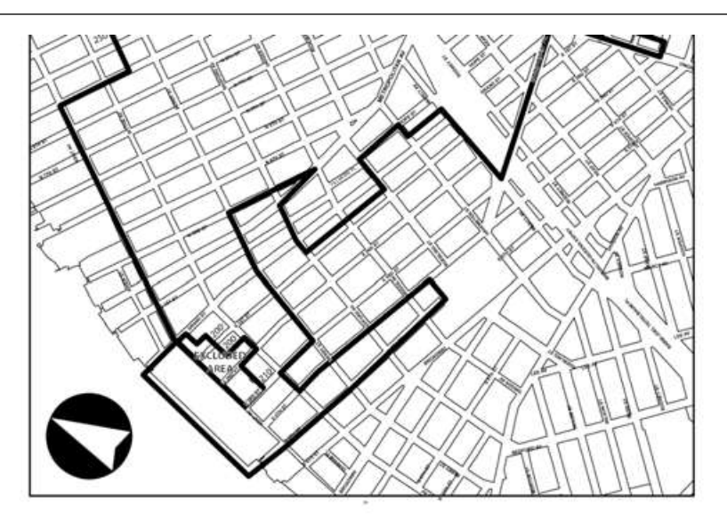
Portion of Community District 1, Brooklyn