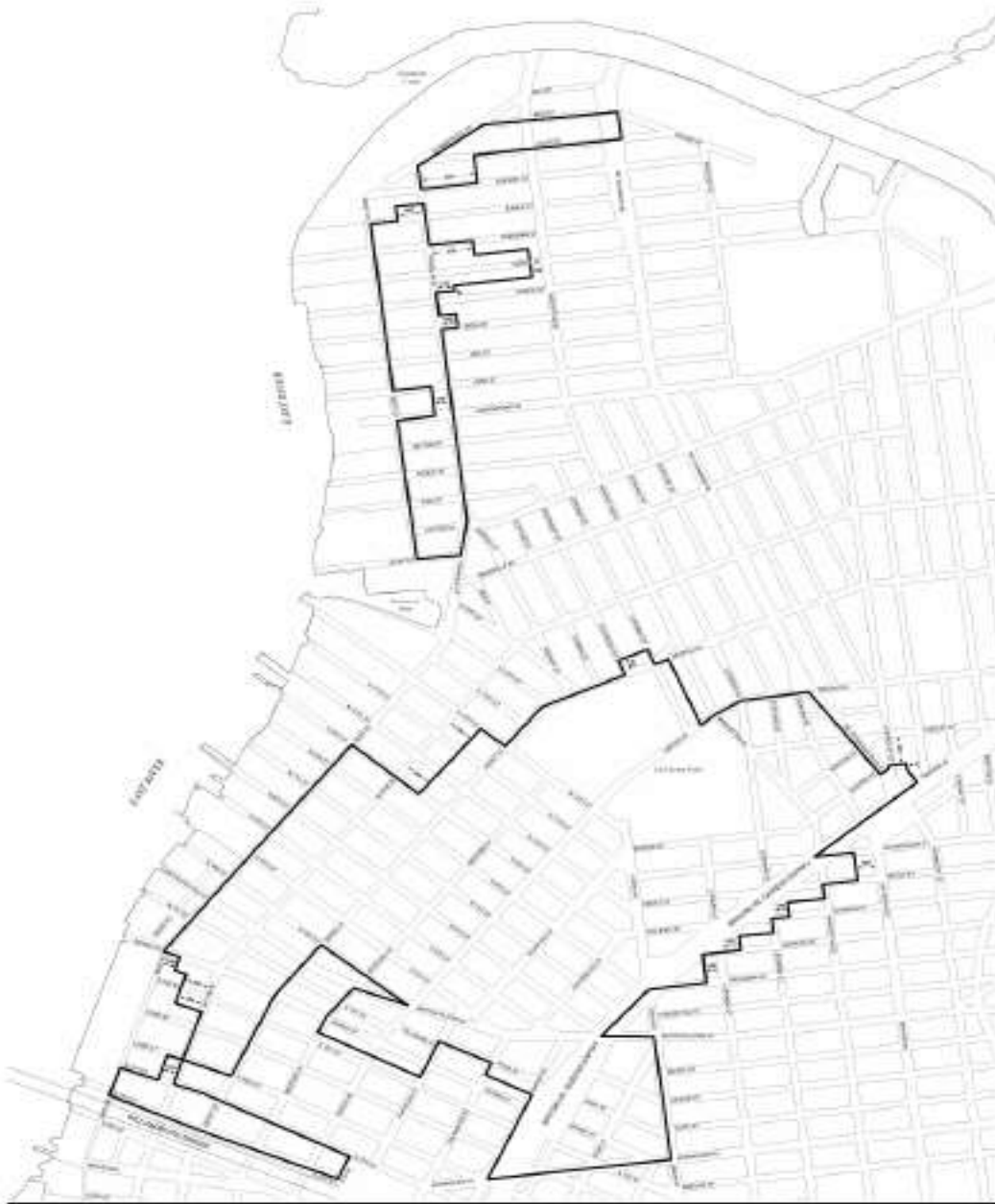
Map 1 Greenpoint-Williamsburg anti-harassment area