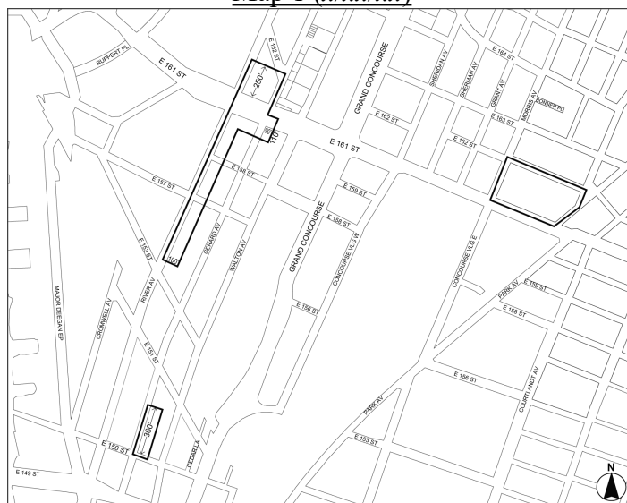
Portion of Community District 4, The Bronx